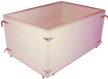
CraigBed closed and latched