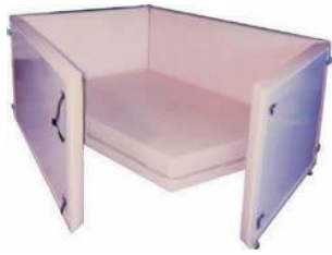
CraigBed with 4' riser block